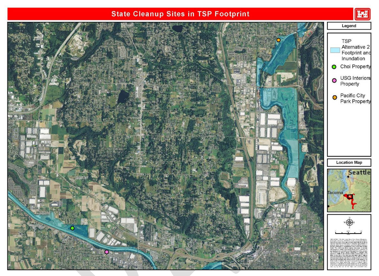
Figure 2 Location of HTRW Sites of Concern